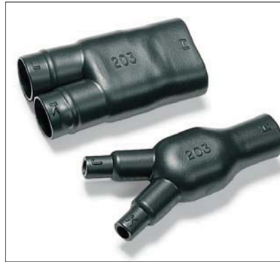
203-1-G supplied / fully recovered.

Branching parts are employed for mechanical tension relief in cable harnesses. For VG shapes with portholes "P" please refer to product standards tables in the appendix.