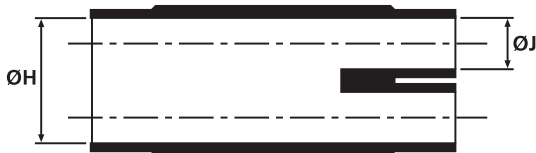
a: Expanded form (supplied)