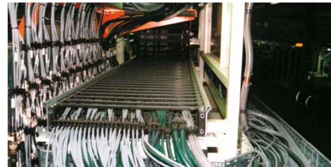
Chainflex® CF5 and CF6 control cables (green) as well as CF211 measuring system cables (gray) in a screwing station of a motor factory. E-Chain®: System E4/00 with chainfix clip strain relief devices

Delivery time 24hr or today. Delivery time means time until shipping of goods.