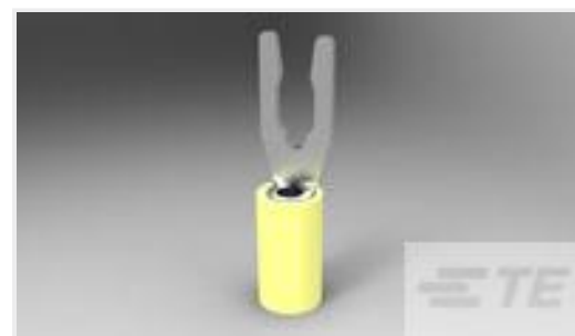
TE Part #52430 TERMINAL,PIDG SPR SPD 12-10 6