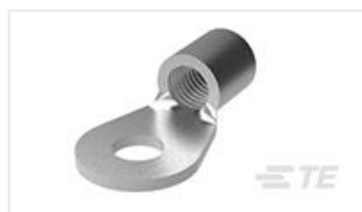
TE Part #33467 TERMINAL,SOLIS R 6 3/8