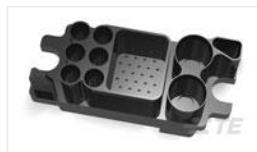
TE Part #1648151-1 241-27-01100