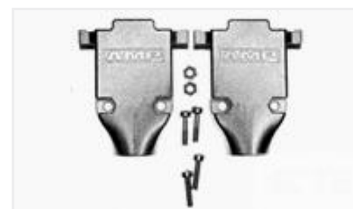
TE Part #5745833-9 CABLE CLAMP KIT,SZ 3