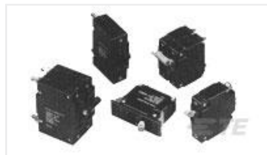
TE Part #4-1393252-0 W67-X2Q10-5=M6/M7/M9/W6/W7