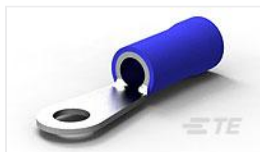
TE Part #52042-3 TERMINAL,R PG 6 1/4