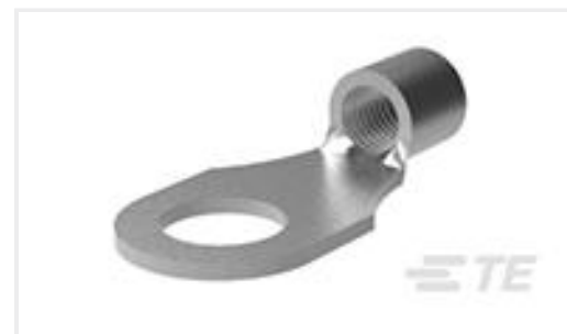
TE Part #321271 TERMINAL,SOLIS R 4/0 5/16