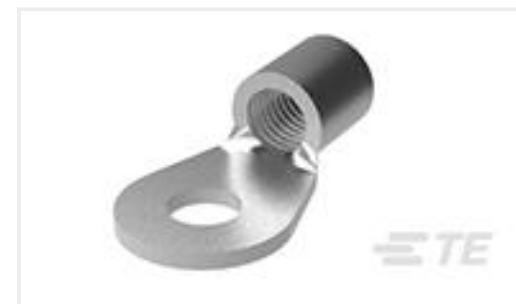
TE Part #321868 TERMINAL SOLIS RING 1/0 3/8