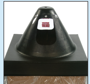
SQUARE DRUM HOOD