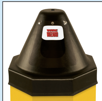
OCTAGON DRUM HOOD