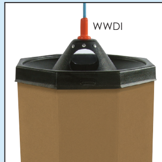
LOW PROFILE OCTAGON HOOD