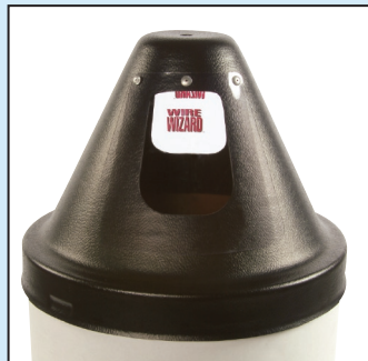
ROUND DRUM HOOD