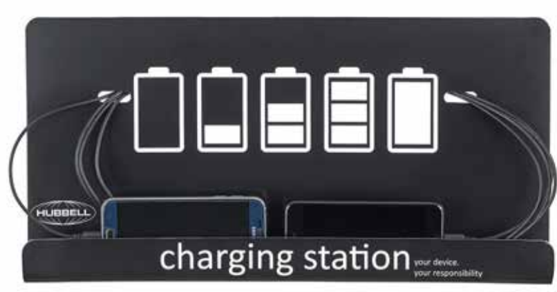
Wall Unit Shown with Standard Design