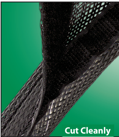
Cut Cleanly Hot Knife