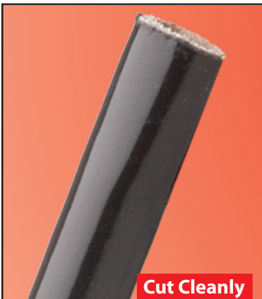
Cut Cleanly Scissors

SF sleeving is rated to 392°F. (Class H), is abrasion resistant, and maintains its flexibility in low temperature environments. It is available in a very wide range of sizes, and is ideal for use in appliance assemblies, wire harnesses, transformer leads, power supplies, motor coil and heater leads.