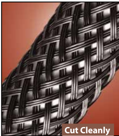
Cut Cleanly Hot Knife