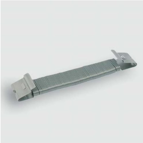
Spring shield clamp