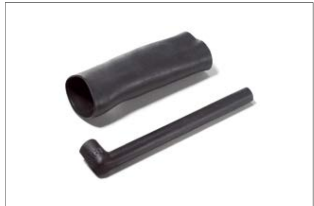
333F322-385 series as supplied / recovered.