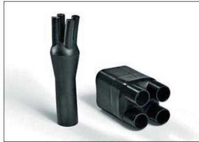
442-1 supplied / fully recovered.

Branching parts are used for easy, time-saving insulation of the branch point of a cable where it is split into single wires. They are manufactured from a tough cross-linked flame retarded polyolefin. Branching parts with hot melt adhesive also serve to relieve the mechanical tension in cable harnesses whilst providing excellent IP ratings.