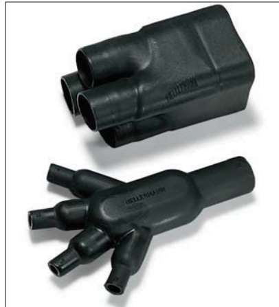
403-1-G supplied / fully recovered.

This style provides cable strain relief and mechanical protection at harness transition points, all outlets are clearly marked to aid orientation on installation.