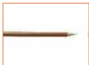
1. A sharpened dowel pin is selected—slightly smaller than the wire diameter