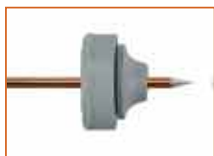
2. The dowel pin is inserted into the opening on the front of the LTB and pushed through the membrane