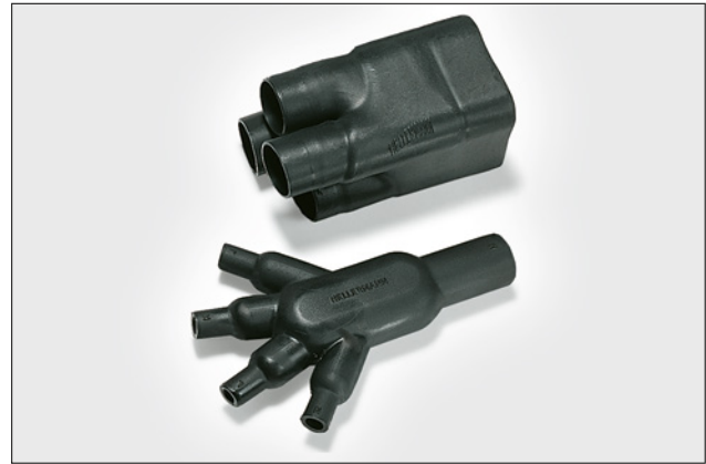
442-1 supplied / fully recovered.