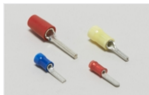
Crimp Wire Pins, Tabs & Ferrules(18)