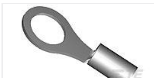
TE Part #324057 TERMINAL, T-N R 1/0 3/8