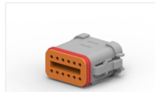
TE Part #DT06-12SA-C017 PLG, 12P, GRY, BLOCKED, A