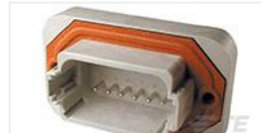
TE Part #DT15-12PA HDR, 12P, GRY, ST, NI/CU, A