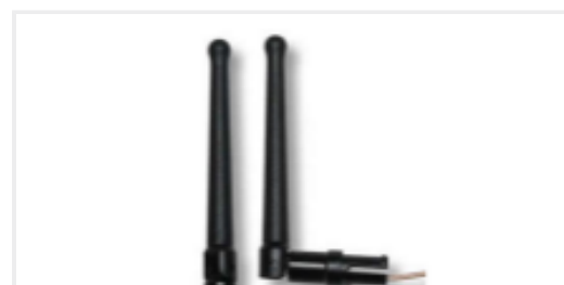
TE Part #MAF94051 Dipol, WTS, BLACK, RSMAM 802.11abg, 2dBi, BCr