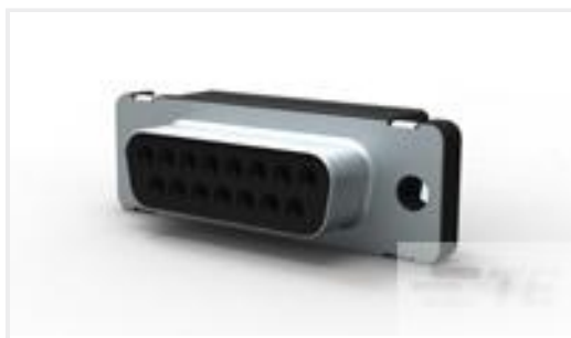
TE Part #1658612-3 15 POS HDF RCPT, MS, LEAD FREE