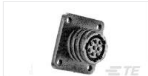
TE Part #206038-4 CPC RECPT ASSEMBLY SIZE 17-28