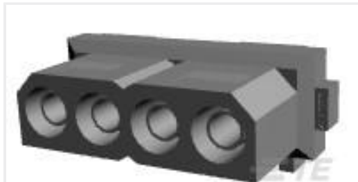
TE Part #770997-1 04P CMNL SOK HDR ASSY