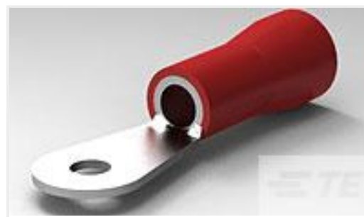
TE Part #52041 TERMINAL, R PG 8 8