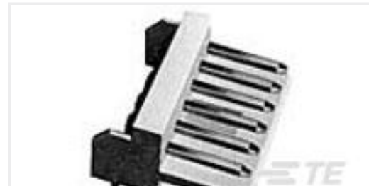
TE Part #171826-3 3P POST HEADER ASSY EI