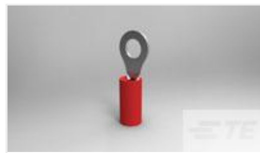
TE Part #2-31886-2 PIDG R 22-16 COMM 22-18 MIL 8