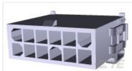
TE Part #794199-1 12P MINI UMNL2 CAP HSG DBLROW