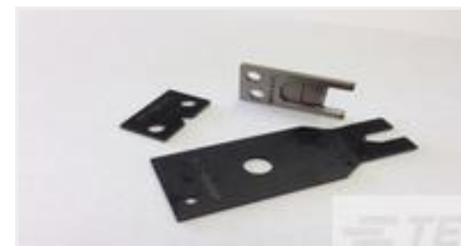
TE Part #2-240651-0 BLADE, SLUG