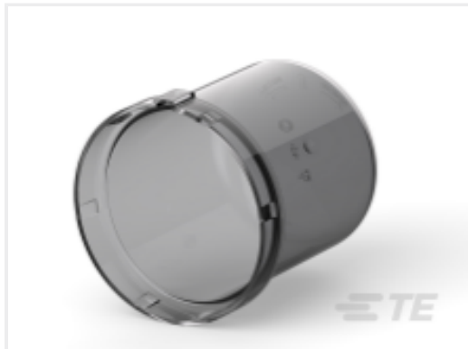
TE Part #2359615-4 LUMAWISE ENDURANCE N+ Lt Gray Tall Dome