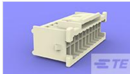
TE Part #2-1969540-2 HOUSING, PLUG, 22P, DUAL ROW, EP2.5