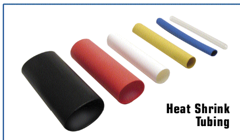
Heat Shrink Tubing

Seamless Pad Provides: • Added Strength • Improved Conductivity • Better Corrosion Resistance