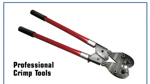
Professional Crimp Tools