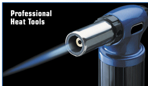
Professional Heat Tools