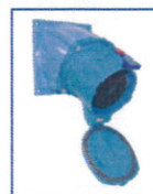
Female Receptacle with Angle Adapter 17-64200 + MA10