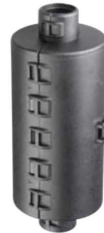
External Hinged Protective Shroud