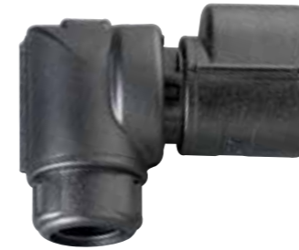
AMP Superseal 90° Elbow Swivel Interface