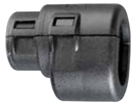
AMP Superseal Straight Interface