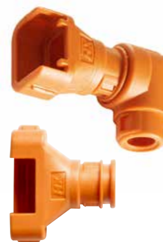
FCI Automotive Apex High Temperature Straight & 90° Elbow Swivel Interface