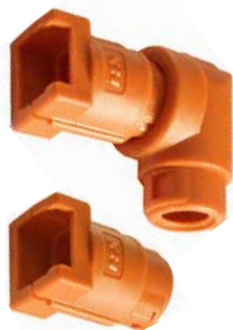
Deutsch - DT Series High Temperature Straight & 90° Elbow Swivel Interface