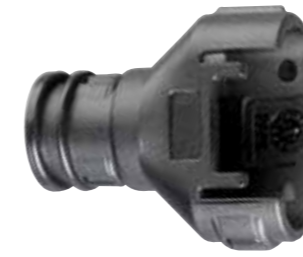
Sumitomo 4 Way Hinged Interface Special Customised Product