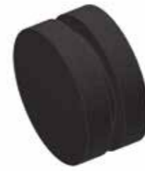
Blanking Cap Accessories