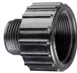
Circular UNEF Connector Interface Sealed Fitting