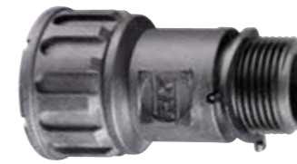
Solenoid Connector Interfaces Sealed Fittings