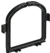
AX101478 GigaBIX Management Ring