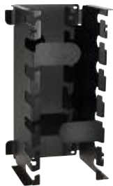
AX101468 GigaBIX Patch Cord Organizer