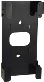
AX101469 GigaBIX Cable Management Module