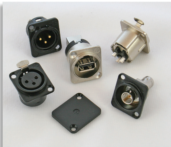
Accepts wide range of industry standard connectors and accessories allowing total customization

BrightEye converters, audio/video/fiber connectors, internal cabling, and other non-Ensemble accessories are not part of the BrightPak Basic. They are shown here to demonstrate the full range and capability of the BrightPak system. Additional connectors can be ordered from companies such as Neutrik, Switchcraft, and Stratos.