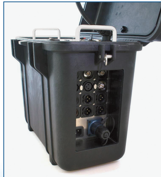
Configure the versatile connector bay to provide exactly the inputs and outputs you need

The BrightPak Basic Kit includes a "D" mount USB connector, an internal USB hub, and all cables needed to support three BrightEye units. The USB connector can be installed in either the side bay or on the top plate. A laptop connected to that connector will have full control over all of the BrightEye units.