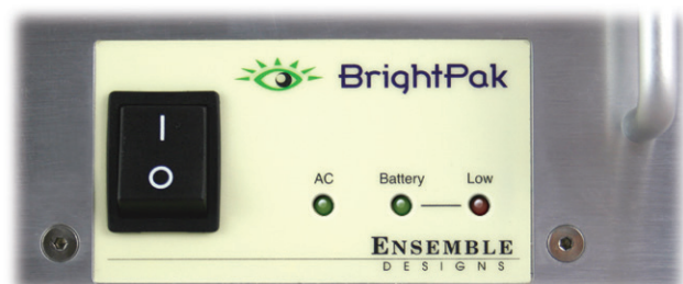
Automatically detects and switches seamlessly to AC power when available