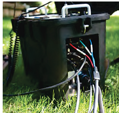
On location, it's the interface point for picture, sound, and communication