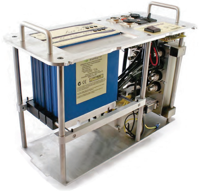
Modular design makes configuration easy. The entire assembly removes from the case for cabling