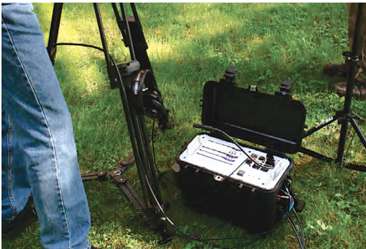
When equipped with Bidirectional fiber, BrightPak supports outbound sound and picture, with return video, sound, and ifb