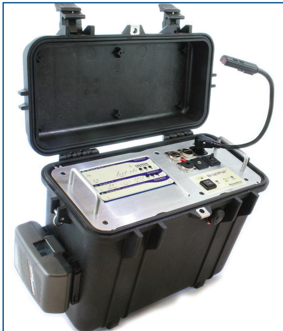
Built from a tough Pelican case, it will stand up to a lot of abuse

100-230 VAC 50/60Hz universal power supply suitable for worldwide operation. Automatic detection/selection of AC versus battery power (BrightPak is not a charger for the battery). BrightPak will switch automatically to battery if the AC power is lost – without any on-air glitch or interruption. IEC power connection installed in the connector side bay. Power on/off switch, AC/Battery indication, and Low Battery Indicator on top plate. Internal fan-out connections of 12 volt power for use with BrightEyes and/or other user-supplied devices. Internal USB Hub with Neutrik 'D' type USB connector. USB connector can be installed in connector side bay or on top plate as desired.