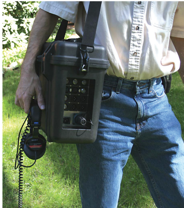
A flexible field case that lets you take video converters, SPGs, and optical transmitters anywhere