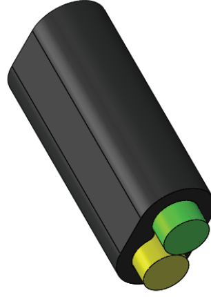
ISOMETRIC VIEW FOR REFERENCE ONLY