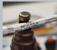
PermaSleeve® Wire Marking