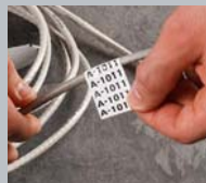
Voice & Data Communications