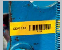
Indoor / Outdoor Vinyl Labels...and more!