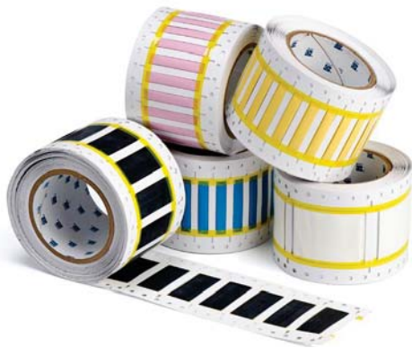
3" core double-sided material rolls.