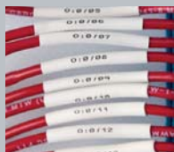
PermaSleeve® Wire Marking Sleeves