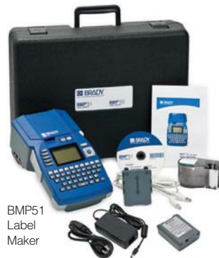
BMP51 Label Maker

BMP®51 & BMP®53 cartridges with label and print ribbon..... page 18