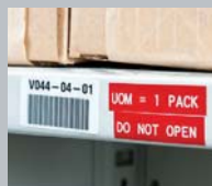
Facility & Safety Identification