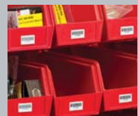
General ID ...and many more!