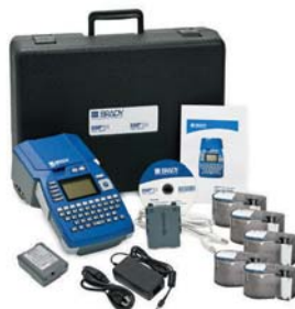
* BMP51 kit shown.