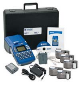
* BMP51 kit shown.