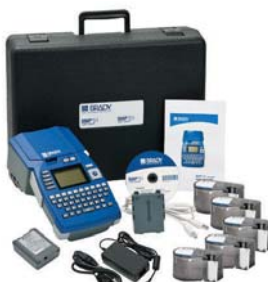
* BMP51 kit shown.