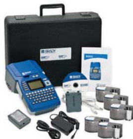
* BMP51 kit shown.