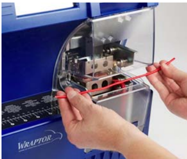
Select print job and insert wire or cable.