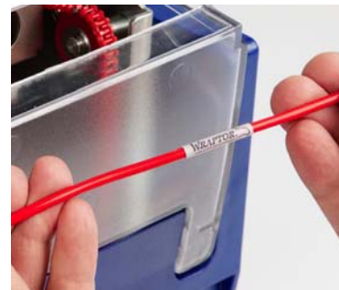
Your label is tightly wrapped and ready to go saving you time and effort.