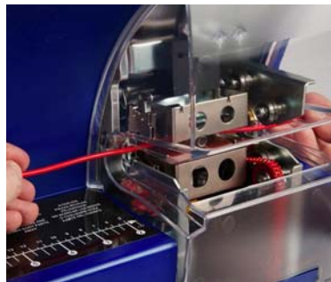
Wraprot prints and wraps in under 5 seconds!