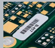
Circuit Board Materials