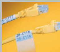
Voice & Data Communications