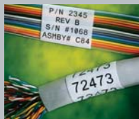
Wire & Cable Labeling