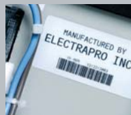
Industrial Barcode Labels