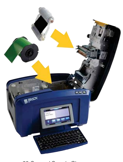
20-Second Supply Changover