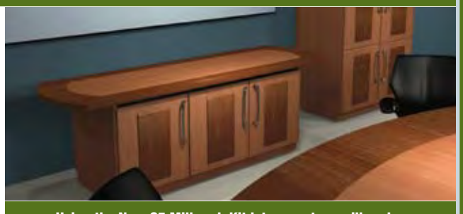
Using the New C5 Millwork Kit lets a custom millworker provide matching outer surfaces. (Not a standard offering)