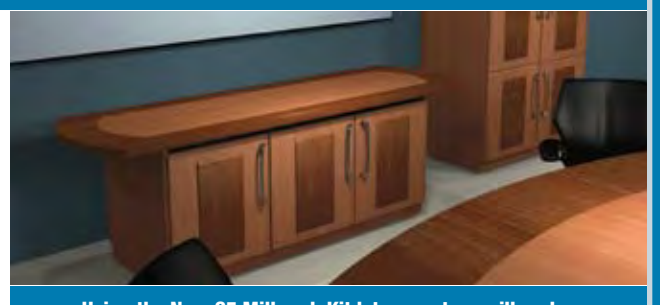
Using the New C5 Millwork Kit lets a custom millworker provide matching outer surfaces. (Not a standard offering)