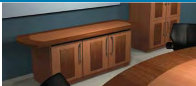
Using the New C5 Millwork Kit lets a custom millworker provide matching outer surfaces. (Not a standard offering)