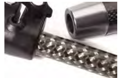
Strong, lightweight, and stable carbon fiber tubes are easy to machine and finish, and mate well with metal fittings.