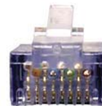
RJ45 with boots