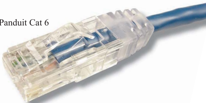
Panduit Cat 6