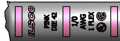
DETAIL E TOP & BOTTOM INK MARK