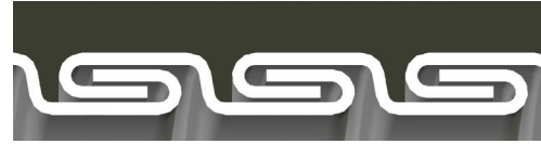
Interlocked Design 1-1/2" through 4"

www.naed.org www.nema.org www.anametelectrical.com