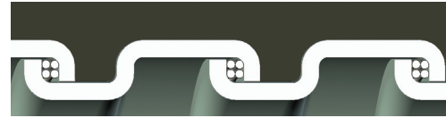
Square-Locked Design with cord packing 3/8" through 1-1/4"