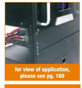
*Panels can be used with any UFA Shelf model