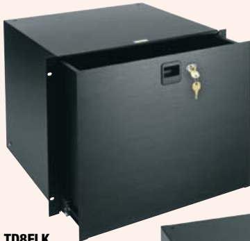
TD8FLK 8 space locking drawer includes letter size 8-1/2" x 11" file hanging kit and installed keylock

Fully enclosed top with inside dimensions measuring 15-7/8" wide by 14-1/2" deep, the D and TD Series drawers feature spring-loaded latches and rugged, straight-forward construction. Installed keylock option available. 2, 3 and 4 space models include drawer mat and rear cable grommet at no extra charge!