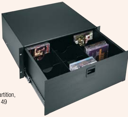
D4 with DCDP partition, see pg. 149