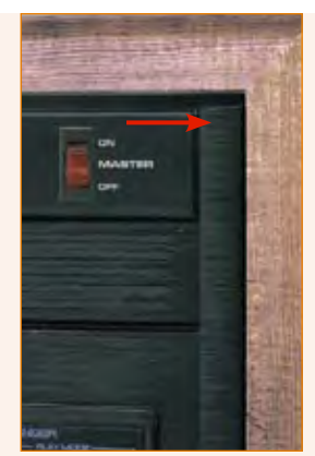
without trim strip installed