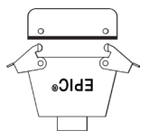
Hood with Levers

Photographs are not to scale and are not true representations of the products in question. For current information go to our website. If not otherwise specified, all values relating to the product are nominal values.