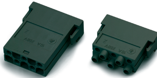
Contacts sold separately, see below

Crimp-Terminated: Stamped & Formed Contacts