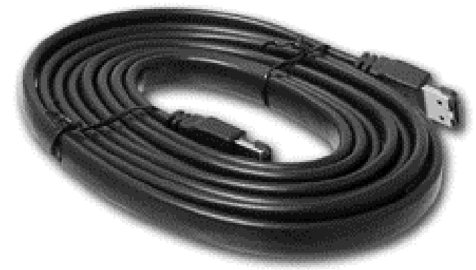
PICTORIAL FOR REFERENCE ONLY