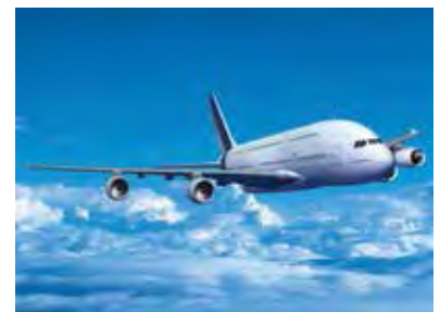
Accepted for use by major aircraft manufacturers.