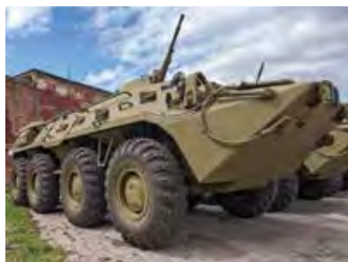
F6 Woven FR is designed to defend and contain wires in difficult environments.