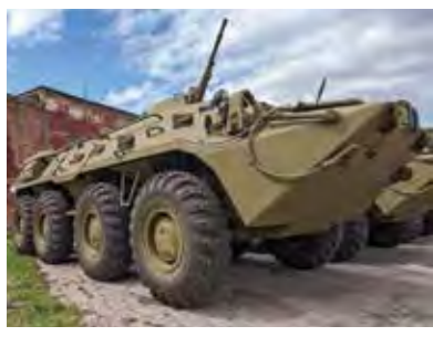
F6 Woven FR is designed to defend and contain wires in difficult environments.