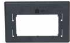
Adapter Plate HMRBBK