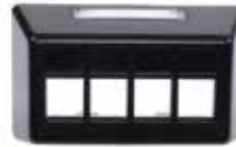
4-Port Inline FP4BBK